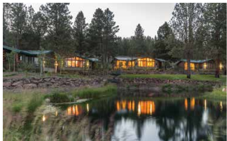
From top: Designed as a reversible golf course, the setting sun highlights hole number two on the Craddock Course and number 16 on Hankins Course. | Guests from Silvies Valley Ranch enjoy the view from Egan's Hideout, one of the resort's dining options. | Luxury cabins overlook the pond at Silvies Valley Ranch, providing rest and reprieve.